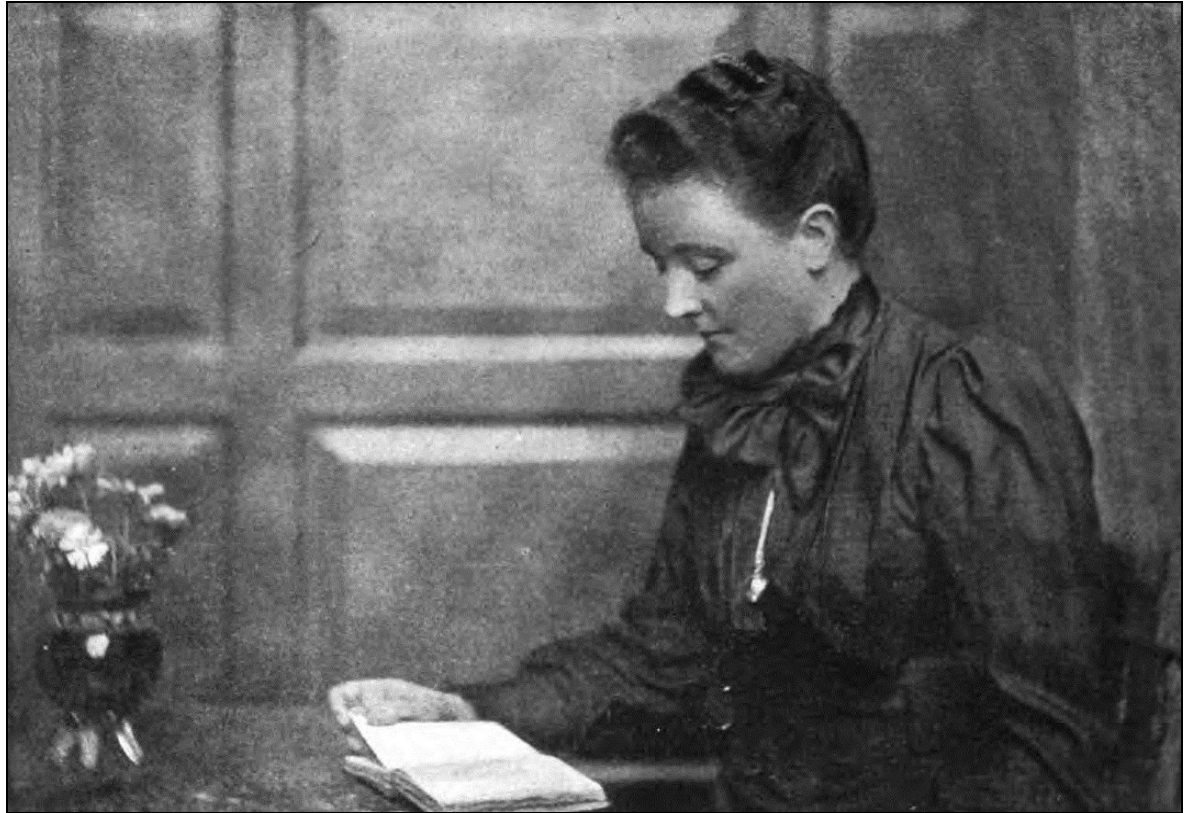
Jewett as a young woman