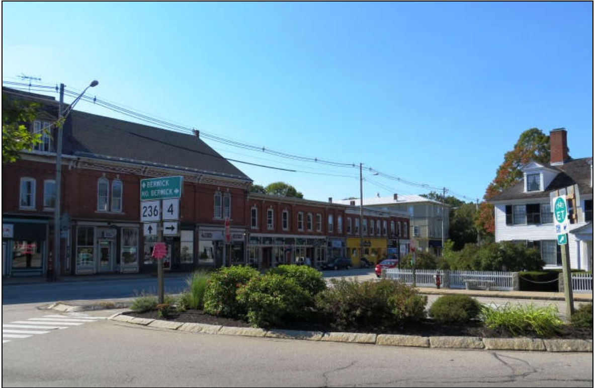
South Berwick, a town in York County, Maine — Jewett's birthplace