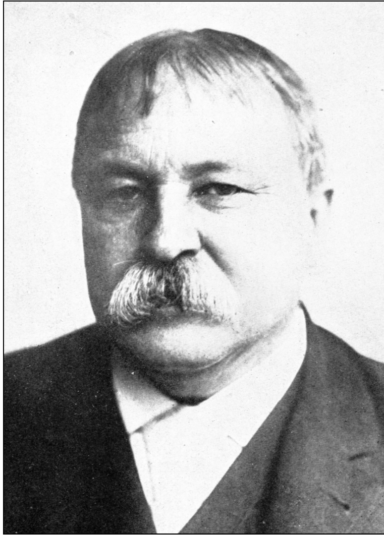
William Dean Howells, c. 1880